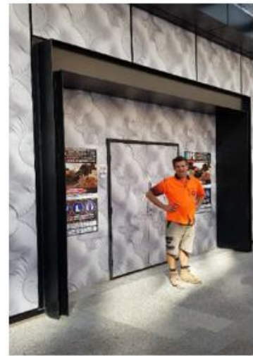
Project Management of your boutique refurbishment