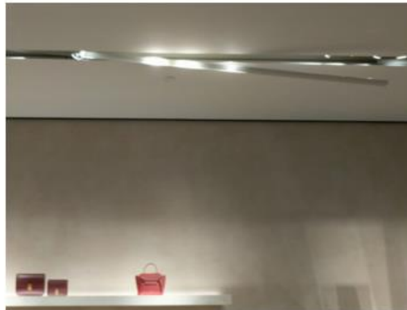
E.G. Emergency shop fitting and electrical repairs