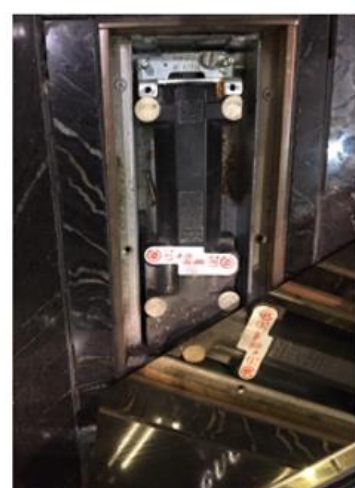
Lock and hinge check, clean, lubricate