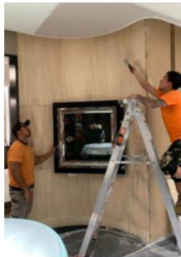
Manufacture and installation of specialized millwork