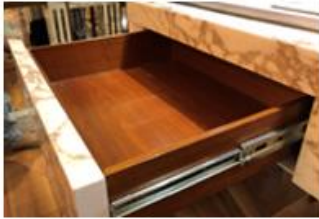
Tighten and/or replace drawer runners