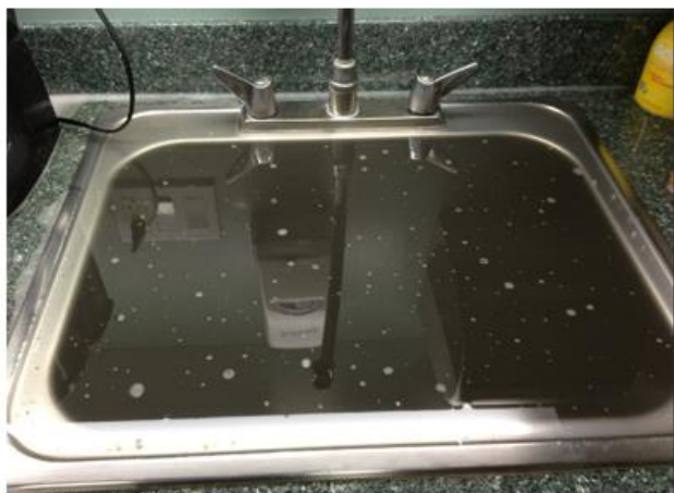
E.G. Emergency plumbing issues solved