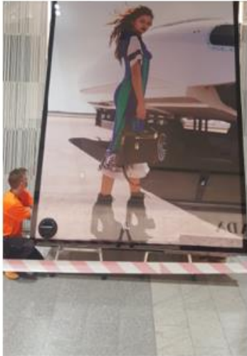
Printing and installation of lightboxes and Duratrans

To keep your stores renewed and on-brand, store refreshment is required on a regular basis. Typical works include installation of window displays and lightbox images, modification, removal and/or replacement of existing cabinetry, electrical refurbishment, carpet and floor covering changes etc. Our extensive experience in Project Management together with our Australia-wide network of specialist trades will ensure we will manage and complete your project on time and within budget – with minimal disruption to your business.