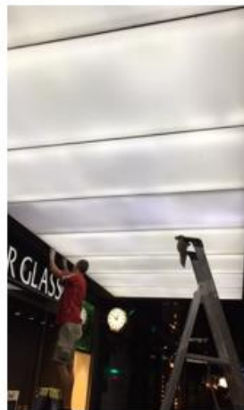
Globe and driver replacement