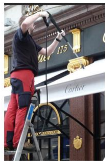
Awning pressure cleaning