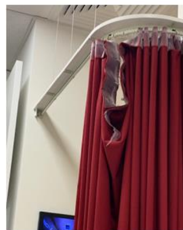
Curtain and track repairs/replacement