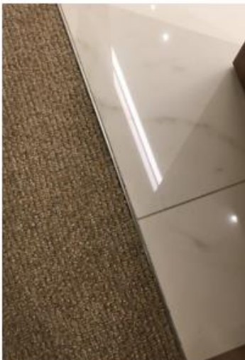
Supply and installation of new floor coverings