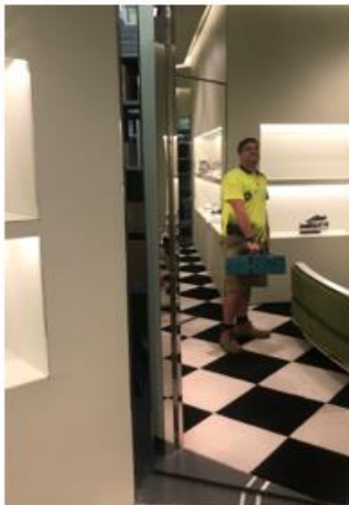
Repair floor tiles and other floor coverings