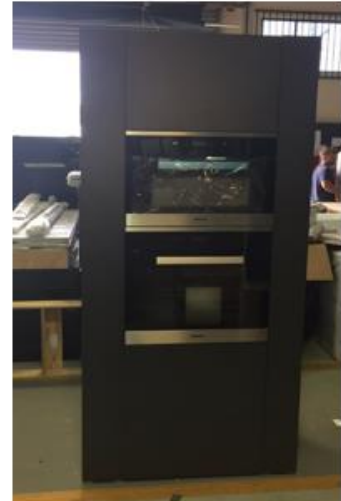
Manufacture and installation of cabinetry