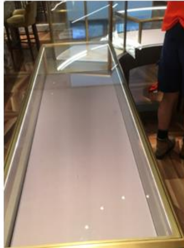
Storage, delivery and installation of new display cases