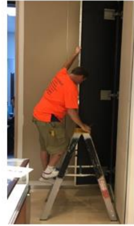
Replace mirrors and repair cabinetry