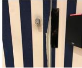
Recover wall panels and reglue/replace wallpaper