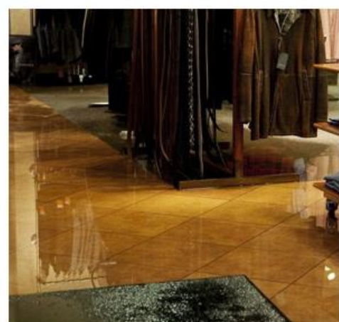
E.G. Emergency water ingress issues resolved