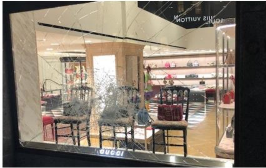
E.G. Emergency glass repair - we will arrange security and glass replacement