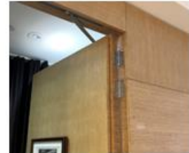
Repair or replace door hinges