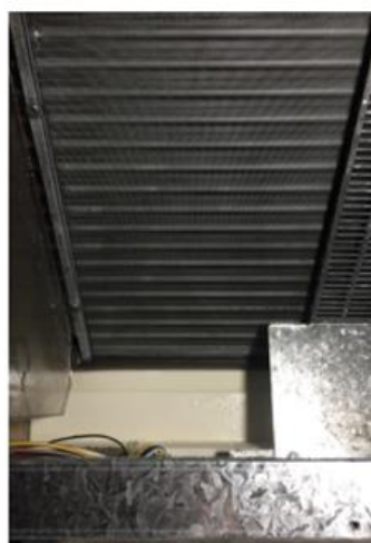
Air conditioning servicing – before and after