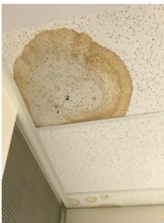
Ceiling tile replacement