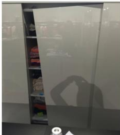
E.G. Emergency cabinetry repairs